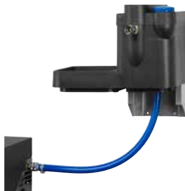
External Water Break Tank for op til 40 ltr/min.