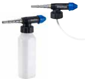
The FoamSprayer technology allows a simple and efficient application of detergent.