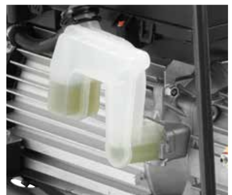
Pump oil tank with oil level sight and fill/empty function.