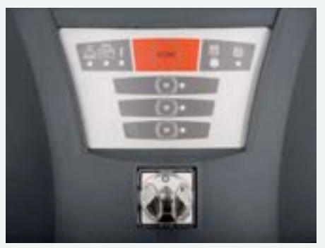
Electronic board control