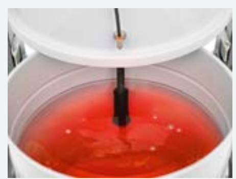
Liquid cut-off system