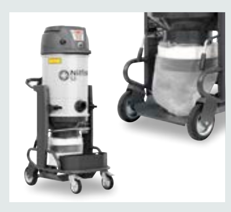
S3 with gravity unload system with Longopac®