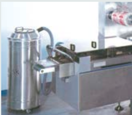
Collection of trims from packaging machine