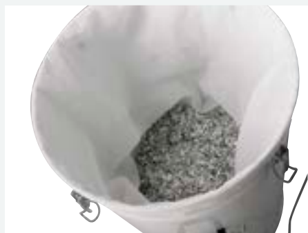
Trims inside the container