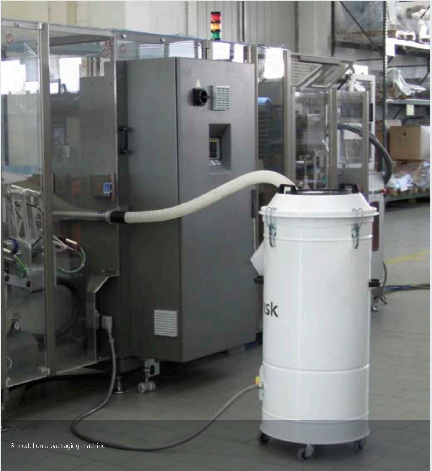
R model on a packaging machine