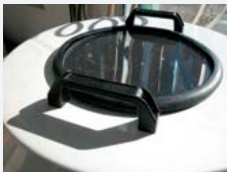
Window to control the trims level