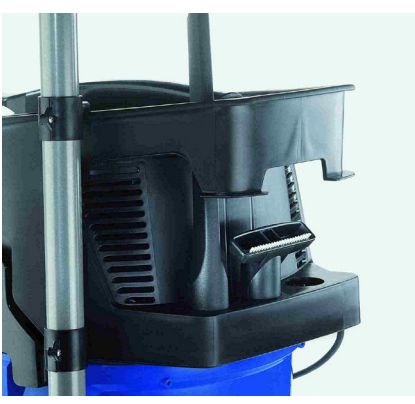
The design lets you have your accessories on hand in a secure way.