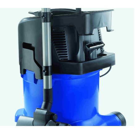
Tube storage, with hook and clip secures a good fit to the machine.