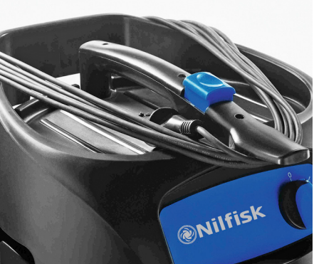
The ergonomic and sturdy grip allows one hand cable rewinding and cable storage.