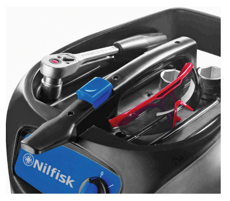
Improved accessory storage, tool deposit and container volume.