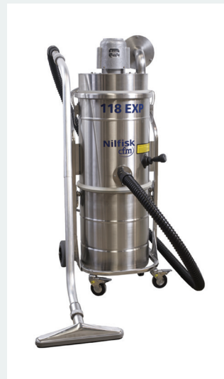
Full line of NRTL-certified, explosion-proof vacuums for combustible dust