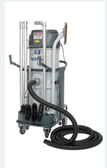
S2 or S3 single-phase vacuums for general housekeeping