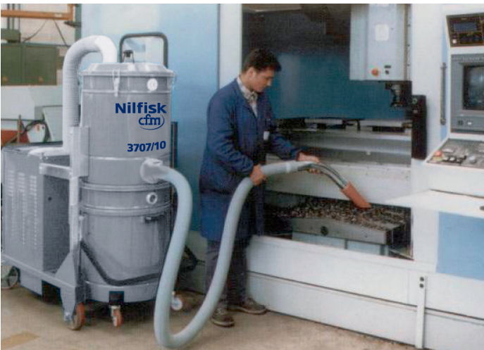
LARGE DEBRIS PICK-UP