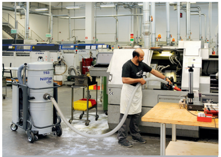
CONTINUOUS DUTY INDUSTRIAL VACUUMS