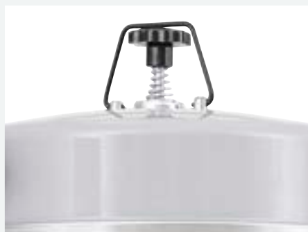
Manual filter shaker