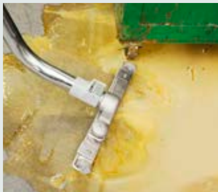
Recovery of oil