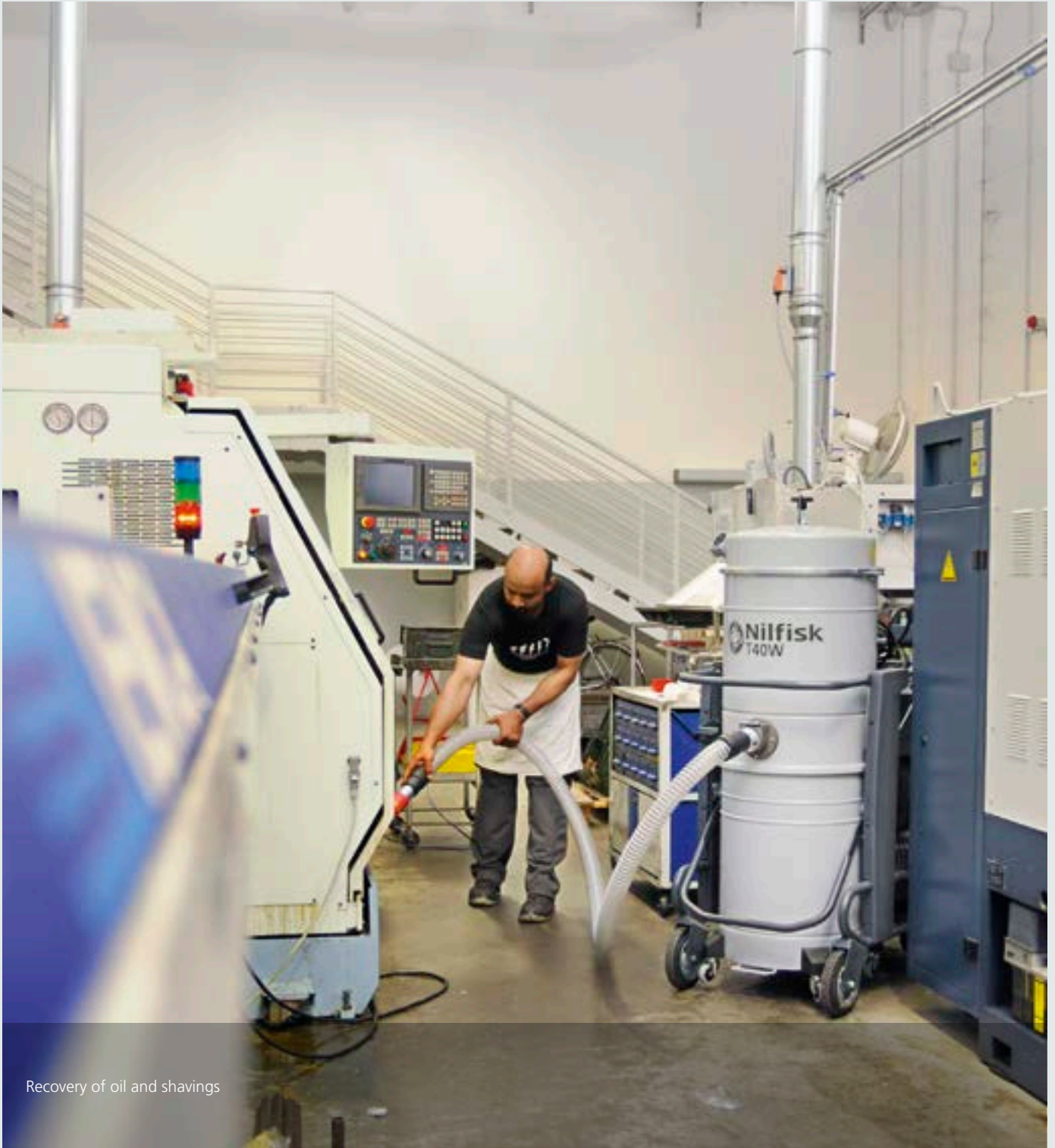
Recovery of oil and shavings