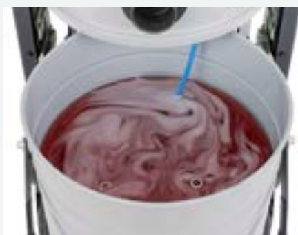
Liquid cut-off on model T40