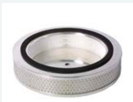
HEPA absolute filter on model T40W