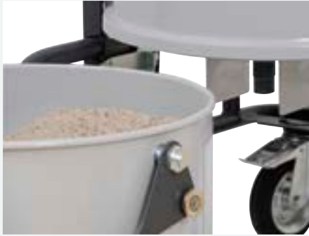
Solid cut-off system