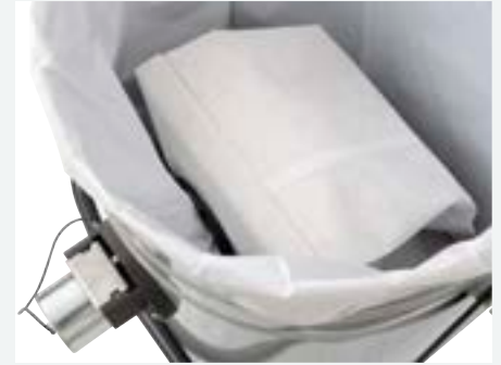
Safe bag for toxic material