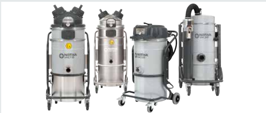
Nilfisk's complete range of compressed air industrial vacuums