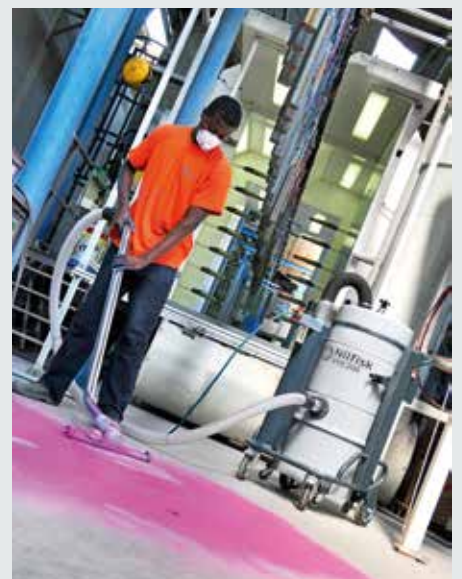
Recovery of epoxy powder from all surfaces