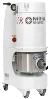
Three-phase up to 4 kW