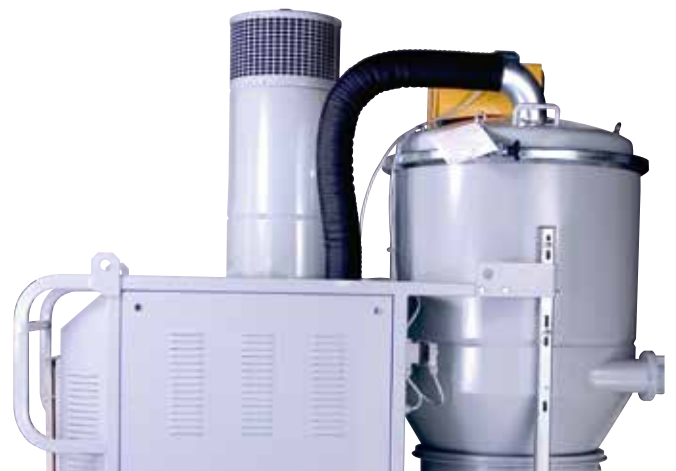
Air outlet diffuser