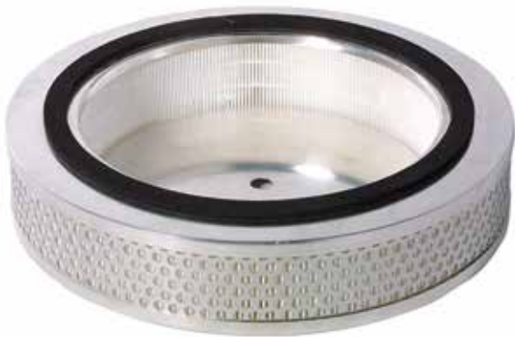
Upstream absolute filter

Visit the site www.nilfisk.com for a free accessories catalogue, including optionals and separators for your vacuum: you'll find the perfect solution to meet your own specific requirements.