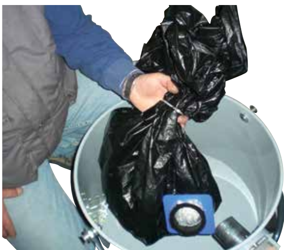
Safe Bag filter