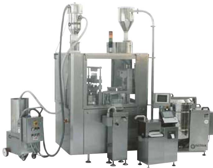
Pneumatic conveyor (left) and capsule pusher (right), in a pharmaceutical company.

Pneumatic conveyors are designed to transport powders and granules from one point to another without changing the mix. These systems are often used to feed automatic machines. The ATEX versions abide by the safety standards used in food production and the chemical-pharmaceutical industry.