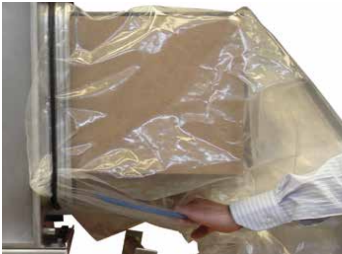
Bag-In Bag-Out filter system