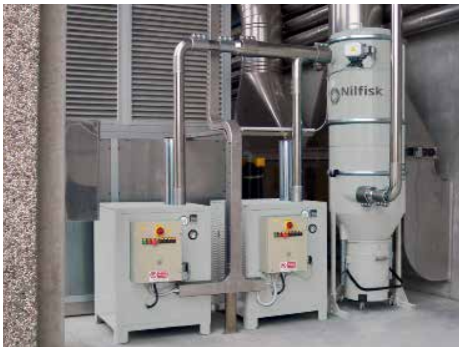
Centralized vacuum system in a chemical company: 2 vacuum units, 1 filter silo.

Centralized vacuum systems are the ideal solution for vacuum applications required in several places simultaneously, and in large environments that may have very different features. ATEX certified systems are often the only choice for large industrial production.