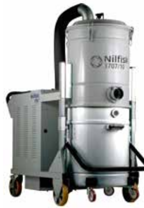
7.5 kW three-phase up to 18.5