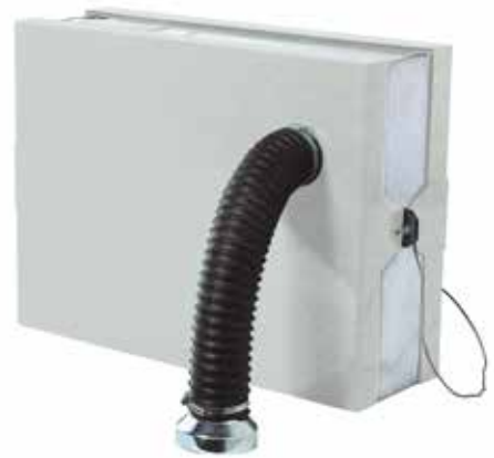
Downstream HEPA filter