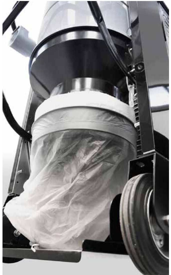
Longopac® "endless" collection system

For more information send an e-mail to industrial-vacuum@nilfisk.com or visit our website www.nilfisk.com .