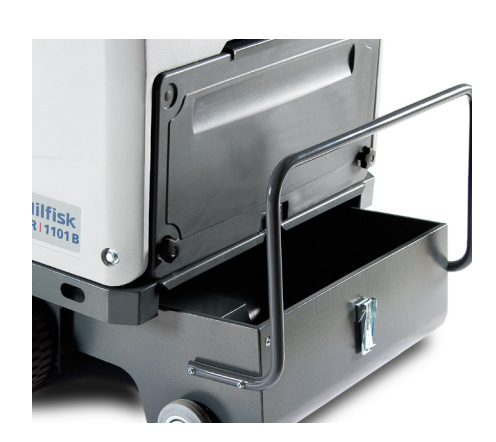
The hopper capacity is extremely large to extend operational time