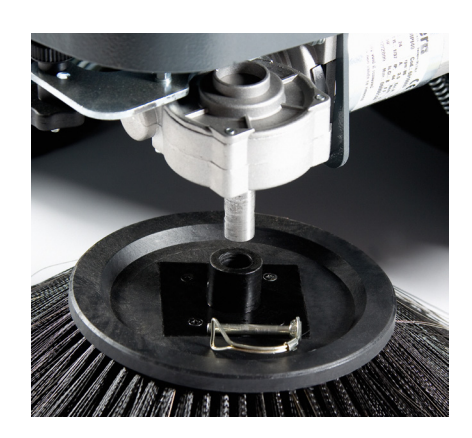
Nilfisk's famous no-tools concept allows fast and easy replacement of brushes and filter for minimal downtime