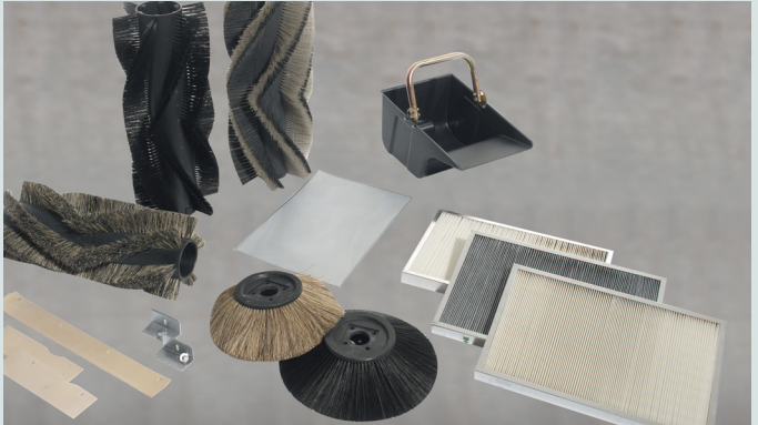
Large range of optional accessories provides the right tools for specific jobs e.g. carpet kit, special filters and brushes, overhead guard, 2x18 litres hopper containers etc.