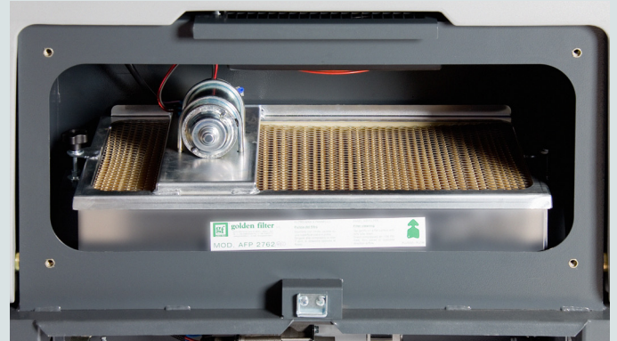
An electrical filter shaking system cleans the filter automatically every 5 minutes \,