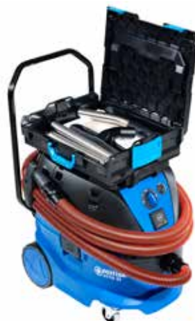
Optional storage box for accessories, extra filter and/or dust bags.