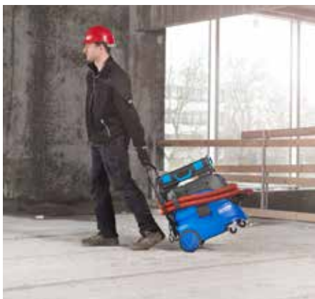
Robust and easy to handle. Convenient transport and flexible storage solution.