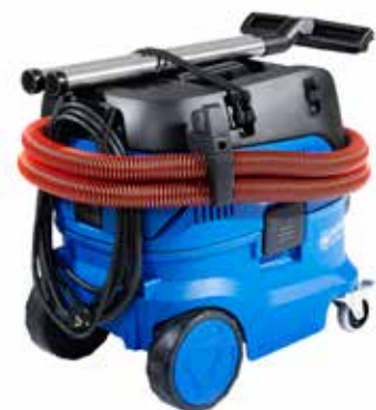
Combined hose and cable hook for easy and quick storage and flexible strap for fixation of power cord, hose and accessories and tools.