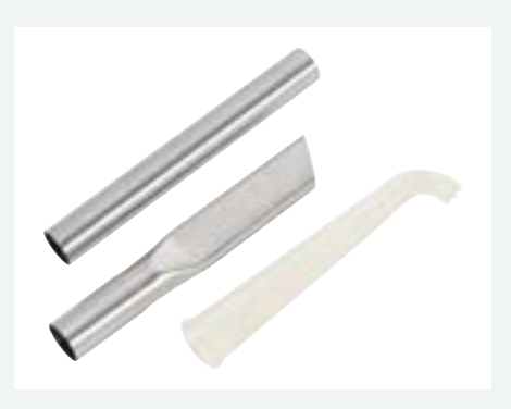
Autoclavable stainless steel and silicone end-tools