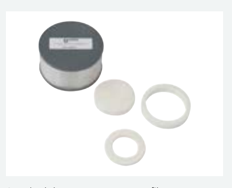
Standard downstream ULPA 15 filter