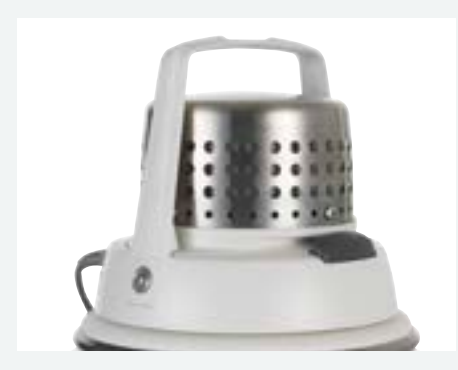
Standard AISI 316 stainless steel