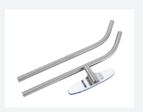
Autoclavable stainless steel handgrip and silicone