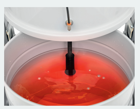
Liquid cut-off system