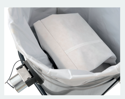
Optional safe bag