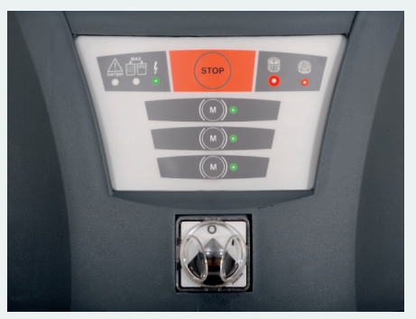
Electronic board control