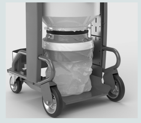
S3 with gravity unload system with Longopac®